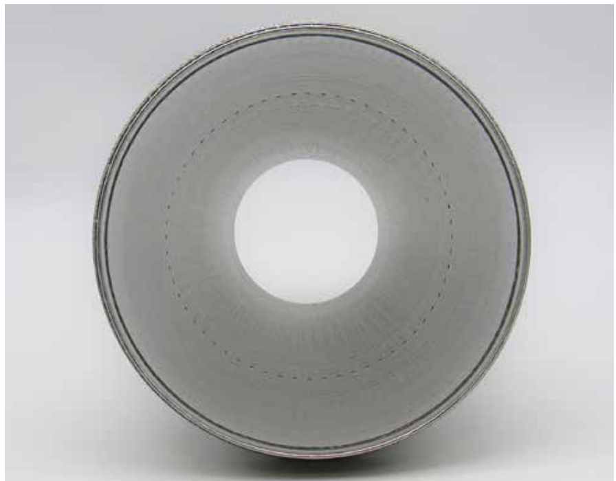
As-printed/heat treated image (top) and after REM Surface Engineering's Extreme ISF ® Process image (bottom) of a LBP-DED rocket nozzle

ested in understanding these companies' capabilities for their laser blown powder DED (LBP-DED) equipment as this technology offers considerably higher part resolution as compared to wire-based DED. Similar to cold spray and friction stir welding, LBP-DED can be used as a repair (i.e. component feature rebuilding) process or as a new component forming process. Recent developments with LBP-DED relative to the fabrication of large-scale rocket nozzles and member experience regarding the advancement/improvement of deposition accuracy and surface finish drove the 3DPC's interest in this technol-