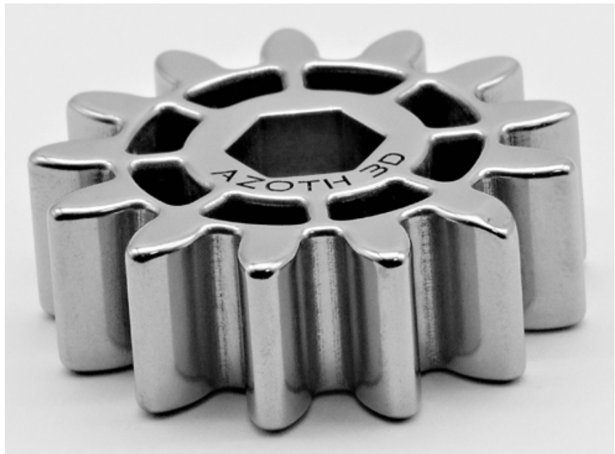
Binder jet gear example printed by Azoth 3D and polished by REM Surface Engineering's Extreme ISF® Process.

Large format metal AM technologies such as directed energy deposition (DED), cold spray, and friction stir welding were deemed “of interest” to the committee due to their potential to serve in a repair capacity for large-scale gearing. Sourcing replacement components for any low-volume application is very difficult. Large-scale gearing fits this mold and has the additional challenge of being (typically) very expensive given the obvious material demands and limited supplier options. Thus, a potential gear repair option for significantly