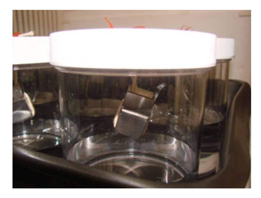
Figure 1 - Samples prepared and ready for test