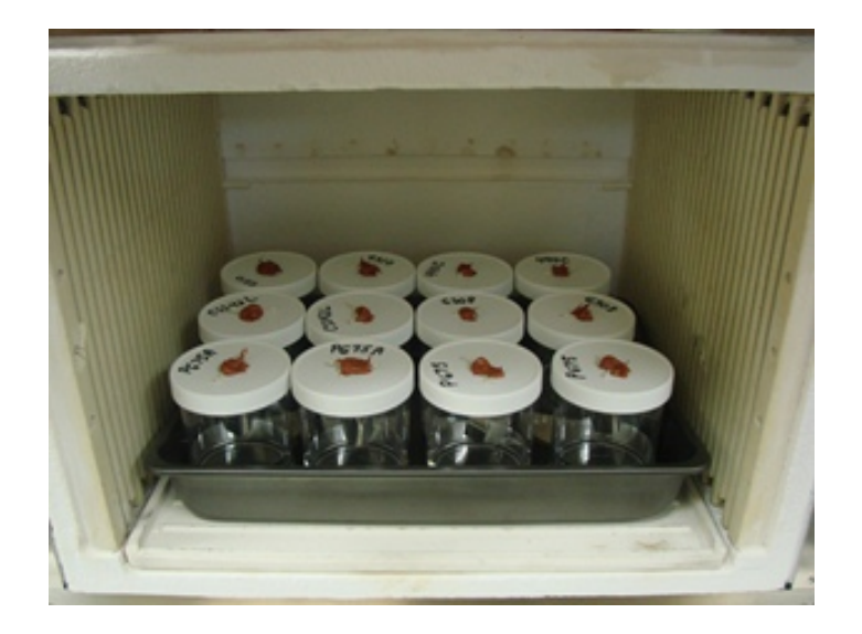
Figure 2 – Samples in oven during test

Testing was conducted with twelve groups of specimens as shown in the following table. Tests were conducted with four specimens from each group. Gear segment specimens for Pyrowear ® 675 925°F temper, Pyrowear ® 675 550°F temper, CSS-42L <sup>TM</sup> 925°F temper, AMS 6308 and AISI 9310 VIM-VAR were all cut from gears previously tested in other programs. The annealed 440C stainless steel has been obtained from a hardware vendor and was hardened by Solar Atmospheres Inc.